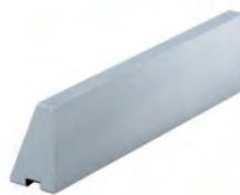
A37 Clamping jaw, for fixed jaw