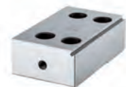
A37 Step jaw SB, for stationary jaw with jaw steps 5x5 mm