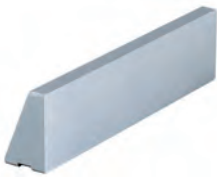
A37 Clamping jaw, for movable jaw