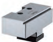
A37 Step jaw SB, for movable jaw with jaw steps 5x5 mm